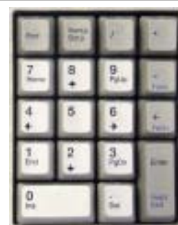
Field+ and Field- keys