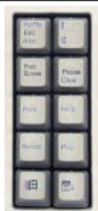
Special 5250 keys as well as the Windows Start and Right-Click keys