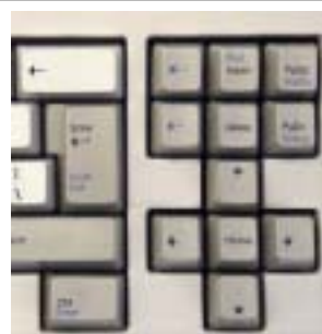
Field Exit, Enter, Dup, and Roll keys are where they're supposed to be.